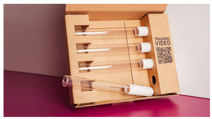
Image 4: The PIEZON® PS Training Tool to perfect your PIEZON® skills.

EMS hosts dedicated PIEZON® and ergonomics Swiss Dental Academy training courses. Thanks to these training courses, your entire team is trained in the application of PIEZON® to ensure successful, standardized treatments. Visit https://professional.airflowdentalspa. com.au/education-training/swiss-dental-academy/ to view our latest training courses. The 2022 calendar will be announced shortly.