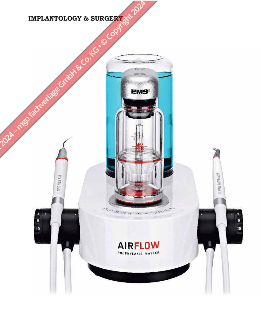
Fig. 2 The Airflow Prophylaxis Master with Airflow MAX – patented Laminar Airflow technology, Perioflow handpiece, Plus powder and Piezon PS No Pain – is a technically, physically and chemically coordinated system for biofilm and calculus management.