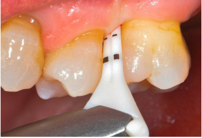
Fig. 7 The Perioflow handpiece with "Nozzle" is used for probing depths of 5–9 mm.

What and how? This concerns self-monitoring of the prevention staff with regard to the degree of perfection of the treat-