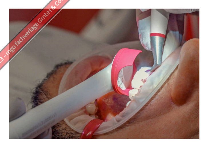
Fig. 6 The supra- and subgingival biofilm (up to 4 mm) is removed with the Airflow Max handpiece.

the guidelines for the correct application of the Airflow and evacuation technique must be learned and observed.