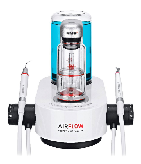
Fig. 5 The Airflow Prophylaxis Master is part of Air-Flowing, a technically, physically and chemically coordinated system.

Special products (EMS Biofilm Discloser) can be used for disclosure (Fig. 3).