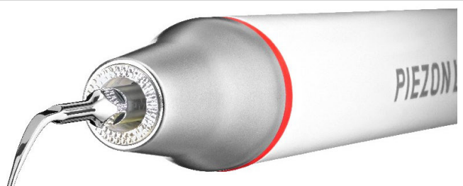
Fig. 8 The Piezon No-Pain technology with the PS instrument removes calculus in a minimally invasive and virtually painless manner.

An important factor in converting the prevention workflow protocol to GBT is achieving a high level of structural and process quality. The proper application of the devices and the systematic approach to GBT can, for example, be learned at the Swiss Dental Academy (SDA), the E.M.S. training institute.